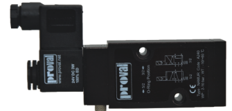
NAMUR Type Solenoid Valves